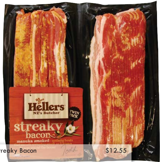
Hellers Streaky Bacon 1kg