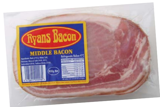
Ryans Middle Bacon 800g